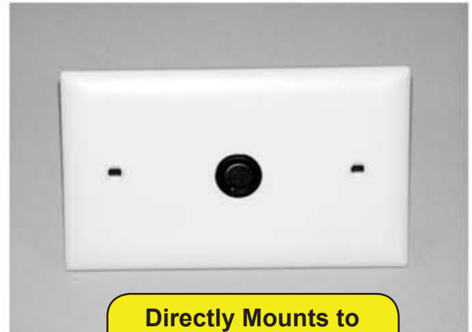
Directly Mounts to Single Gang Box