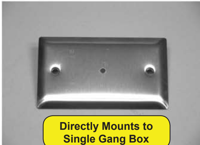
Directly Mounts to Single Gang Box