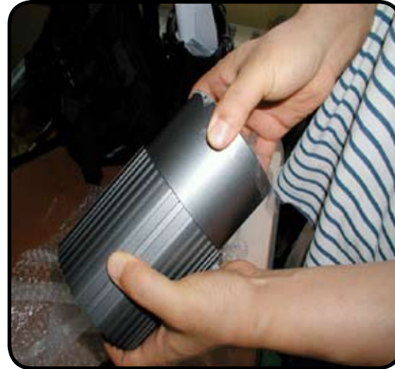
2. Turn the Front Structure counter-clockwise to remove it.