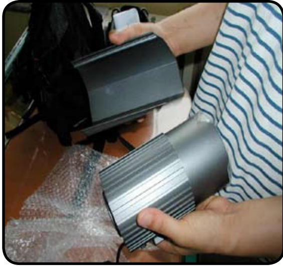
1. Remove the sunshield.